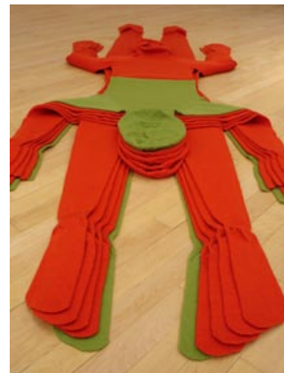
Experimental floor based installation based on 'Flick Flack'