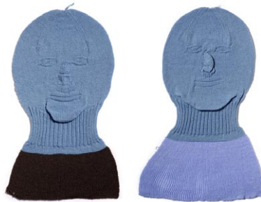
Eddie + Billy 2007 Wool yarn 450 x 240 mm