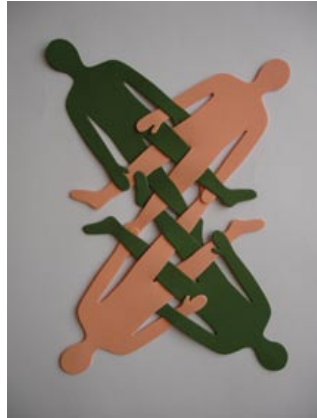
Under + Over Mixed Media 38 x 30 x 9 1/2 cm