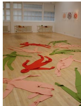
Final floor-based installation and exhibition of artifacts