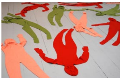
The Perfect 2007 Wool yarn Installation at Vestlandske Kunstindustrimuseum, Bergen, Norway 2007