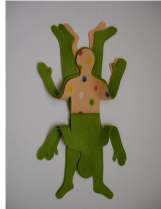
Flick Flack Felt 38 x 30 x 9 1/2 cm