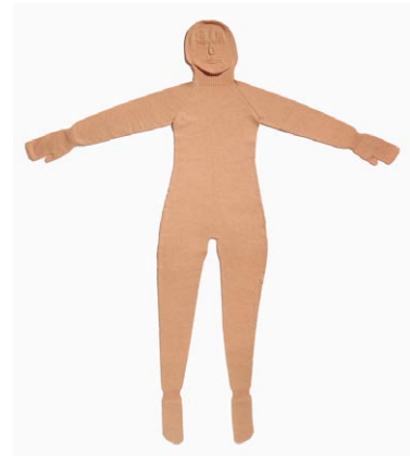
The Perfect Body 2007 Wool yarn 1920 x 1640 mm