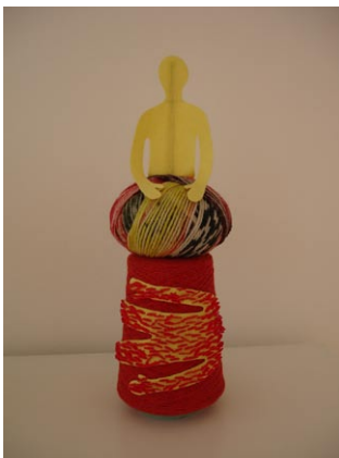
1 + ball + cone + 1+ (red) Felt, wool and mixed media 37 x 12 x 12 cm