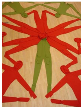
Initial experimental floor-based installation