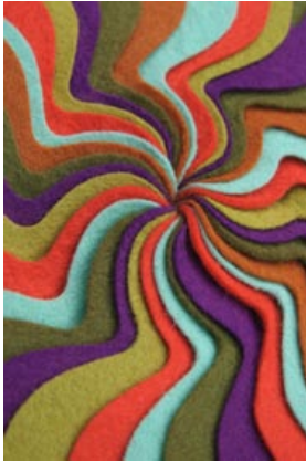
34 x 1 x 1/2 (detail) Felt 34 x 1 x 1/2 cm

The Perfect, Exhibition of artifacts and installation, Contemporary Applied Arts, London, 14 June – 7 July 2007