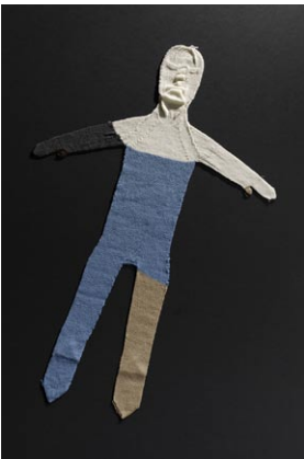
The Perfect: Alex 2007 Wool and acrylic yarn 580 x 920 mm