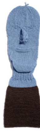
Tom 2007 Wool and acrylic yarn 360 x 110 mm