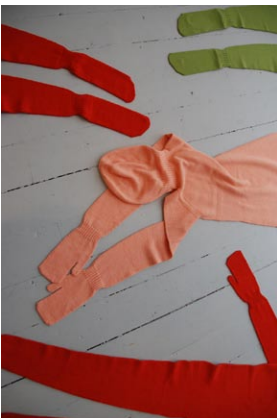
The Perfect 2007 Wool yarn Installation at Vestlandske Kunstindustrimuseum, Bergen, Norway 2007